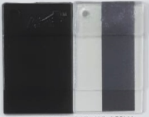
RAINBOW G. 7917 (10-150) \mu