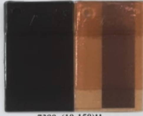
7390 (10-150) \mu