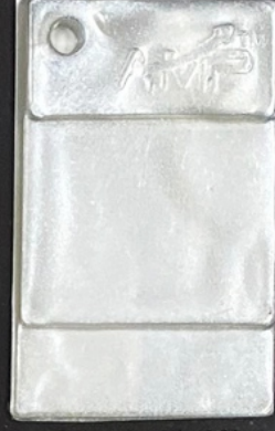
S. GRAY (10-60)μ