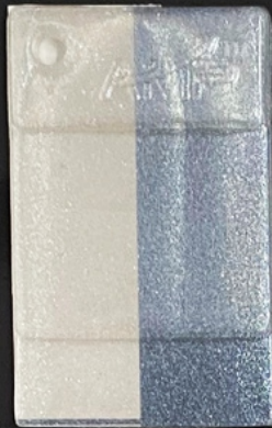
S. 163D (20-200)μ