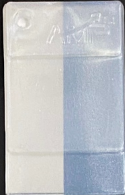
S. 100D (10-60)μ