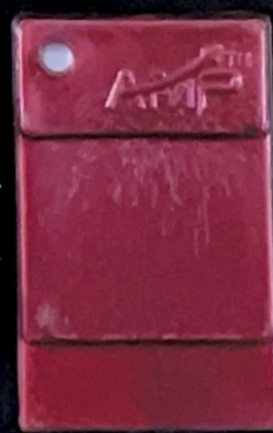
504 RB (10-60) \mu