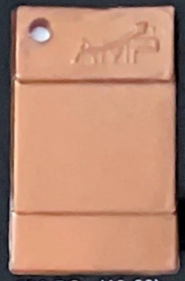
500 PG. (10-60) \mu