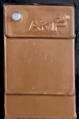
500 FB (10-60) \mu