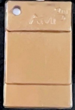
500 DG (10-60) \mu