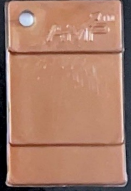
500 IG (10-60) \mu